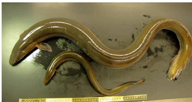
Figure 1. Phenotypic Differences between Freshwater and Brackish/Saltwater Ecotypes

Two sexually maturing female American eels were captured in the St. Lawrence River during their spawning migration en route to the Sargasso Sea. The large eel is representative of the slow-growing, late-maturing (>20 years) ecotype that characterizes the Lake Ontario–Upper St. Lawrence River, the numbers of which are in steep decline. The small eel is representative of the brackish/saltwater ecotype, which is fast growing and early maturing (about 5 years) and this individual is the result of a transplant of young eels from the Atlantic coast to Lake Ontario in an attempt to mitigate the decline of eels in that region. Contrary to conservation goals, the transplanted individuals did not exhibit the phenotype that characterizes the receiving region.