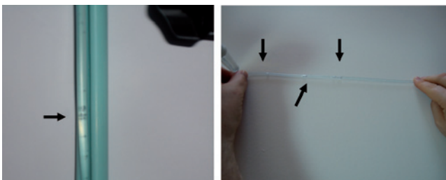
Figure 3 Bubbles formed at set of the S-line brand warmer.