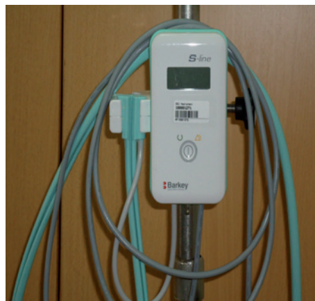
Figure 1 S-line blood-liquid warmer.

S-line and Astoflo ® brand serum warmers were mounted on two serum hangers at equal high levels. Before the study, temperatures at the proximal, midway and distal parts of lines, temperature of experiment environment, temperature of liquid used and temperature of liquid reaching the cannula after warming were measured in order to determine the warming level of liquid warmers (Fluke 87 V, USA). We recorded time to visually observable bubble formation. We prepared a 1,000 mL 0.9% NaCl solution for infusion with the same brand serum sets (Mediset). After filling the serum set reservoirs equally with liquid, we filled serum sets with 0.9 % NaCl taking care to avoid any bubbles. In order to mimic the clinical scenario and to stabilise flow rates, we mounted