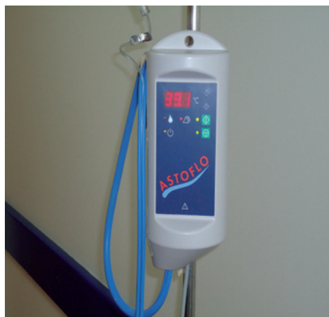
Figure 2 Astoflo ® blood-liquid warmer.

a “drop adjusting set” (Lacus, Ankara) and 18-gauge cannula (Bıçakçılar, İzmir) at the end of the serum set. We repeated these procedures 10 times in each group.