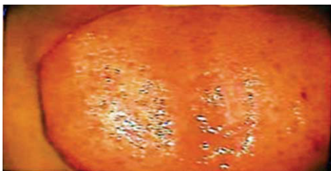
Figure 2. Photograph of the tongue under colposcopic perspective 15 days after surgery.

virus gene-typing with PCR, this procedure revealed presence of a 58 genotype. This datum has not been documented in the classification reported in literature.