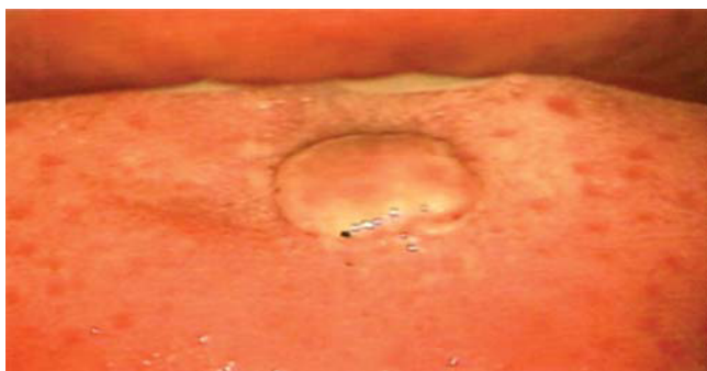
Figure 1. Direct inspection of the mouth under colposcopic perspective. I (Hinselmann, 2014), with 0.66 magnification. Lesion measuring 1 cm diameter, of pinkish hue, circular shape, jagged edges, avascular and without pedicle.

There are several techniques to diagnose HPV, among them we can count conventional cytology, liquid base cytology, histology, colposcopy and molecular biology techniques such as in situ hybridation and polymerase chain reaction (PCR). 15,16 In the clinical case here presented it was decided to undertake