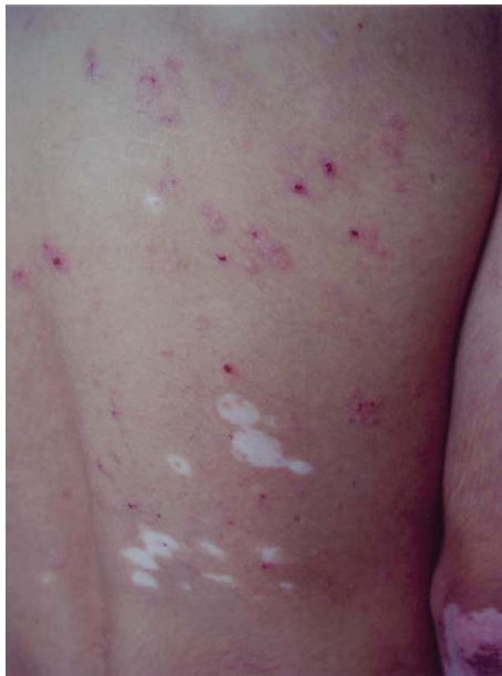
Figure 2. Close-up appearance of the lesions.

overlying epidermis was observed. There were no melanocytes in the basement layer of the epidermis (Figure 3A).