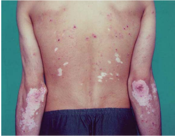
Figure 1. Papulovesicular lesions and vitiliginous plaques on the back.