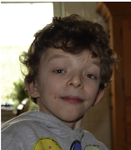
Fig. 2. A boy with Noonan syndrome caused by a PTPN11 mutation. Note a bilateral downslant of the palpebral fissures, ptosis, a broad nasal bridge and low set posteriorly rotated ears.

hematopoiesis. For many of these conditions, bone marrow transplantation is the treatment of choice. Great care should be given to ensure that a non affected family member will be selected as donor. Therefore, recognition of these syndromes is of prime importance.