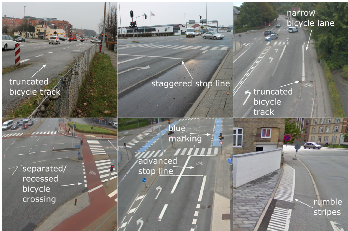
Fig. 1. Different geometric layouts of bicycle facilities. Image of rumble stripes: Google.

Various studies have evaluated the safety effects of different geometric layouts (illustrated in Fig. 1) in signalized intersections to assess which layout is safest for the cyclists. Based on comparisons of the safety of bicycle tracks and lanes in intersections, the suggestion was terminating the bicycle track 20–30 m before the intersection and force the road users to drive closer to each other to improve the visibility of the cyclist (Herrstedt, 1979). Two layouts were tested against a full-length bicycle track for the remaining section leading up to the intersection from where the bicycle track was