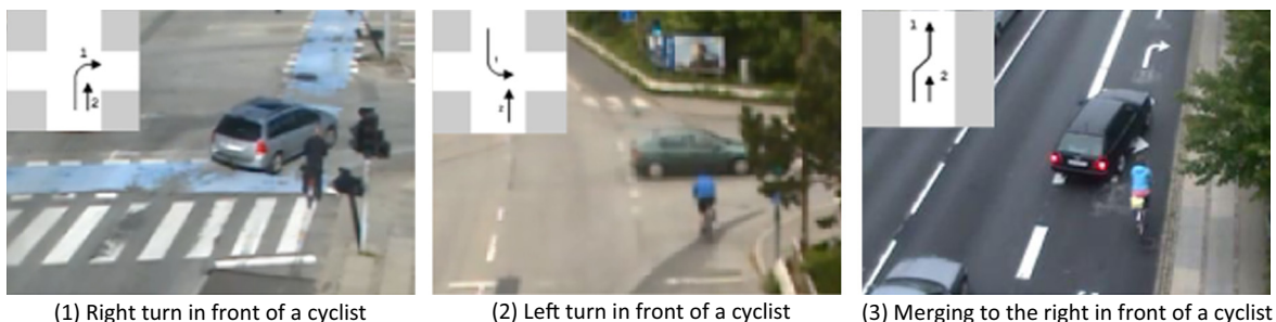
Fig. 2. Types of traffic conflicts included in the study.

In layouts with bicycle tracks, the track is elevated above the road and separated with a curb. The bicycle track is discontinued at the stop line just before the intersection and continues at the same level as the road inside the intersection.