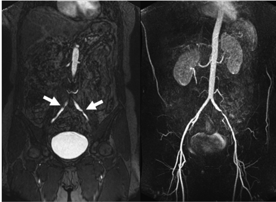
Figure 2 Example images highlighting stenoses (arrowed) in common iliac arteries on (left) a source image, and (right) a MIP image of the abdominal station of a 60-year-old woman. Of particular interest is the fact that the source images have been useful on this occasion for identifying pathology in the right iliac artery, which is not noted on the MIP reconstruction.

highlighted in Table 2 . Of the 53 segments where disease was detected, 34 cases were scored as grade 1 (minor stenosis 1–50%), five cases were scored as grade 2 (moderate stenosis 51–70%), 11 cases were scored as grade 3 (severe stenosis 70–99%), and three cases were scored as grade 4 (vessel occlusion). However, the vast majority of segments were considered radiologically normal.