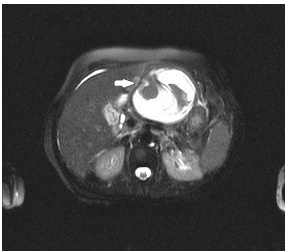
Fig. 2. MRI image showing the drained cyst consisting blood in left lobe of liver, magnetic resonance cholangiopancreatography.

One day after the discharge, the patient was admitted to hospital with hemobilia again. She was accepted to ICU and IV fluid and electrolytes had been administered. On 22nd of July an ERCP was performed and with the help of balloon the hematoma filling the common bile duct was removed (Fig. 5). Beside the fluid and electrolyte treatment, 2 units of erythrocyte suspension was