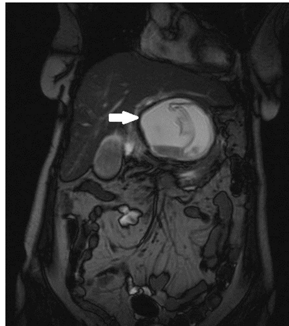
Fig. 3. MRCP image showing hematoma in gall bladder (magnetic resonance cholangiopancreatography).

administered. The patient stayed stable hemodynamically; therefore we did not make any intervention for hemorrhagia. During the following three days, patient was stable, fed orally. When the laboratory findings decreased to normal values, the patient was discharged on 26th of July.