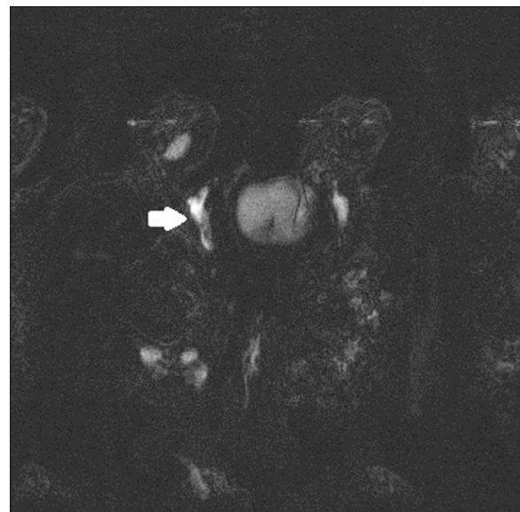
Fig. 4. MRCP image showing hematoma filling the common bile duct, magnetic resonance cholangiopancreatography.

She stayed at 3rd degree ICU and had mechanical ventilation support for 8 days because of severe pneumonia. Culture