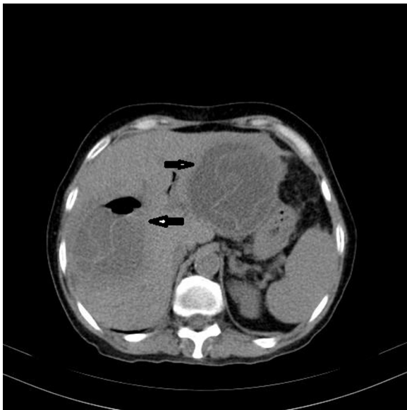
Fig. 1. CT image showing the hydatid cyst that PAIR was performed.

jaundice, hematemesis and melaena. Her pain was recurrent and colic in character. At physical exam, she had tachycardia (110/min), jaundice, tenderness in right upper quadrant of abdomen and melaena at rectal digital examination. She had a hemoglobin value of 8 gr/dl. She had been accepted to intensive care unit (ICU), a central line was attained and 3 units of erythrocyte suspension were administered with appropriate fluid and electrolyte resuscitation. Hemobilia was detected by abdominal ultrasonography and magnetic resonance cholangiopancreatography (MRCP) (Figs. 2, 3 and 4). By performing endoscopic retrograde cholangiopancreatography (ERCP) and endoscopic sphincterotomy, blood degradation products were cleaned from the common bile duct. After the patient stayed hemodynamically stabilized, she was discharged from the hospital in 21th July.