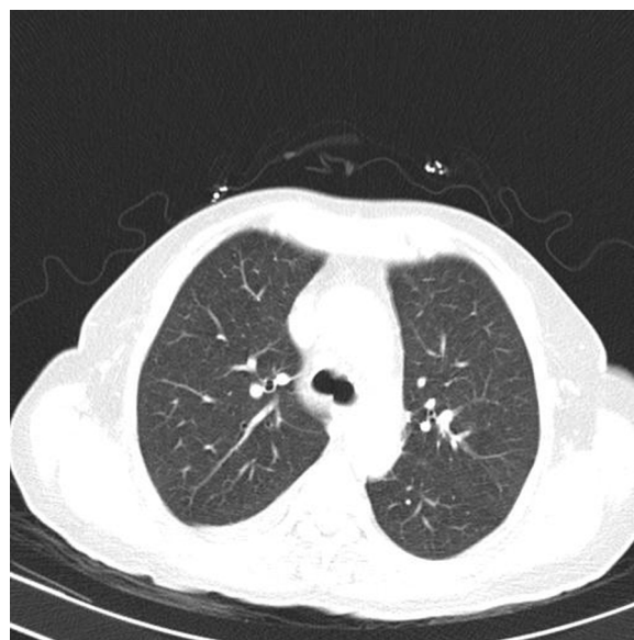
Fig. 7. Thorax computed tomography, treated pneumonia.

At her control visit on the 22nd of November, at abdominal ultrasonography cyst cavity at right lobe was disappeared and postoperative changes were seen. The cyst at left lobe was measured 56 \times 40 mm in diameter. She gained 4 kg after her last discharge.