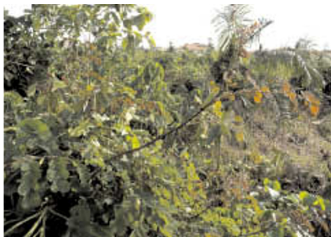
Figure 1. M. benthamianum .

The presence of some peptides, unsaturated long chain aldehydes, alkaloidal constituents, essential oils, flavonoids, saponins and tannins have been confirmed in M. benthamianum [21,22] , therefore this plant is worthy to be studied for its anti- candidal and antioxidant properties, since documented studies on the antifungal activities of the plant are scanty to the best of the authors' knowledge. Methyl gallate and gallic acid has been identified as the