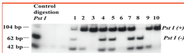
Figure 2 Genotypes of different Egyptian diabetic children at the INS 3' PstI RFLP. In most, the presence of the PstI restriction site indicates the presence of a class III allele visualized at the VNTR on the chromosome, whereas the absence of the restriction site indicates the presence of a class I allele on the chromosome. The numbering at the top of each lane indicates different samples.