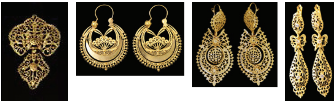
Fig.3 Portuguese jewelry - Heart of Jesus, Collection

It was at this time that some of the models that still mark the Portuguese identity, such as the Heart of Jesus, created by jewelers of the queen - the Rocaille style-, the Lacas, the rings, the earrings to the Queen, who later in the 19th century, gave rise to the King Earrings.