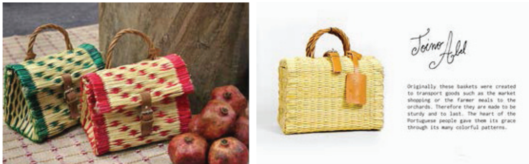
Fig 4 Toino Abel Collection

the “Contas de Amor”, small hollow spheres executed in gold, decorated with fine filigree wire. The reasons are inspired by embroidered regional costumes and Viana do Castelo scarves. Traditionally Viana accounts were collected by Minho girls to make necklaces that were part of their dowry.