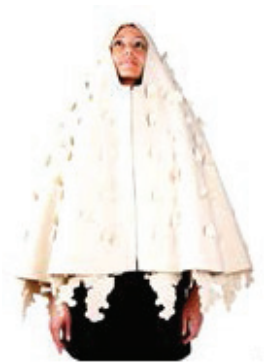
Fig.1 The “Capucha”