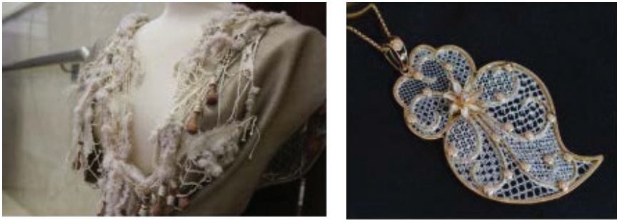
Fig 6 - The lacework “Bilros de Peniche”

“The focus on product innovation and attracting new niche markets is an important part of all the strategy around sustainability of Peniche bobbin-lace” [16].