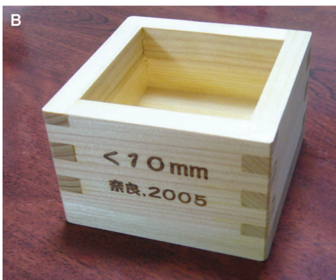
FIGURE 1. (A) “Kagamibiraki,” Opening a Japanese sake barrel head at the reception (the Garden of Nara-Ken New Public Hall). (B) A wooden cup for Japanese sake printing <10 mm. It is challenging to detect nodules <10 mm in diameter, that is, “curable lung cancer.”

causes of death in the highest-risk subcohort of people aged 60 to 75 years with at least 30 to 80 pack-years of smoking. It found that the 5- and 10-year rates of death from causes other than lung cancer (conditional on not dying from lung cancer) were low, 3% and 7%, respectively.