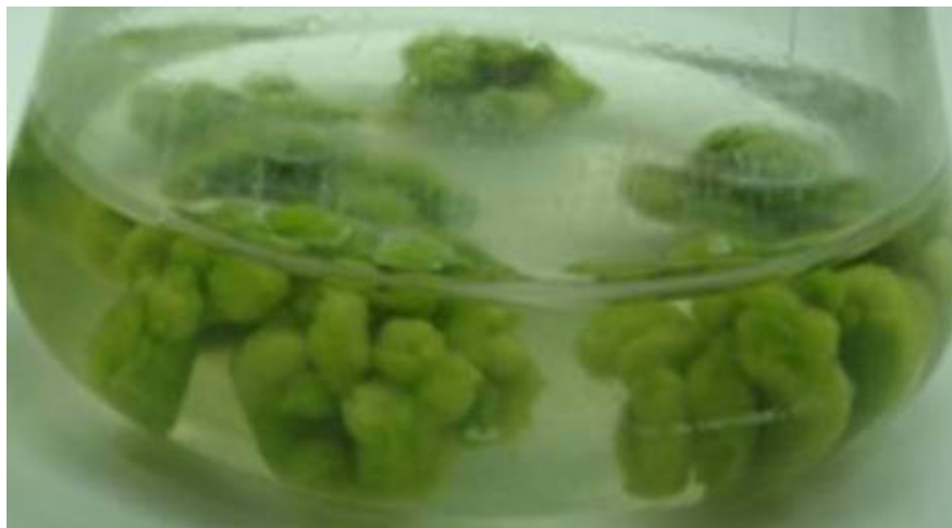
Figure2. PLB after 3 weeks in liquid medium (VW).

The PLB was subcultured on Vacint and Went (VW) liquid medium in 15% coconut water (CW). It was contained of cytokinin, auxin and gibberellin hormones as well as other compounds in order to stimulate the germination and growth of PLB Dendrobium orchid (Katuuk, 2000). The PLB have been subcultured in liquid medium for 3 weeks culture (Fig. 2)