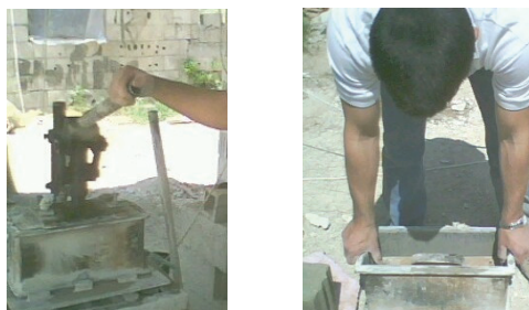
Figure 2: Manufacture of blocks

The five mixes containing recycled aggregates and the reference mix containing only natural aggregates have been prepared and marked as follows: A, B, C, D, E and F. The tables 5a and 5b show the composition of each mix.