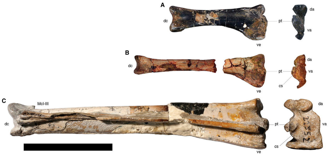
Figure 2. Comparison of Three-Dimensionally Preserved Pterosaur Wing Metacarpals Illustrating the Character States of Nonpterodactyloid and Pterodactyloid Pterosaurs in Anterior and Proximal Views

(A) Nonpterodactyloid Comodactylus ostromi Galton 1981 (YPM 9150), courtesy of the Yale Peabody Museum of Natural History.