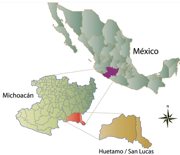
Figure 1. Location of the study region in the Balsas River Basin, States of Michoacán and Guerrero, México, where Llaveia axin has been reported. The insect was only found in 3 localities in the Municipalities of Huetamo (Arroyo Hondo, N=2 ) and San Lucas (San Pedrito, N=1 ).

Sampling design. In September 2006, based on topographic and vegetation maps of the Balsas River Basin in the South-West region of the state of Michoacán and the North of the state of Guerrero the sites were “aje” populations have been reported were located (Fig. 1). Fifteen localities were found and visited; 13 in the state of Michoacán (Rancho Tomatlán, Tziritzícuaro, San Lucas, El Coco, Rancho el Tecolote, Arroyo Hondo, San Jerónimo, Cuahutémoc, Pinzán Colorado, El Limón, La Cuchilla, and Monte Grande), and 2 in the State of Guerrero (Cutzamala and Zirándaro). In each locality, 3 km trails were walked looking for the incidence of the “aje”. Once found, the geographic position of the populations was obtained with a GPS (Garmin 12 XL, Olathe, KS, USA). To verify the presence of “aje” populations, each of the 15 sites was visited 4 times throughout 2006 and 2007. In October 2006, only 2 populations in Arroyo Hondo (Municipality of Huetamo) were found. These populations are thereafter referred to as Arroyo Hondo 1 and Arroyo Hondo 2 (Fig. 1). In November 2006, a third population in San Pedrito (Municipality of San Lucas) was found. All populations were located in Michoacán (Fig. 1). No other populations were found in the remaining localities. Between the years of 1976 and 2000, the Municipalities of Huetamo and San Lucas lost ca. 30 140.4 ha of tropical dry forest at a rate of 1 255.8 ha/yr (C. Pacheco, pers. inf. ).