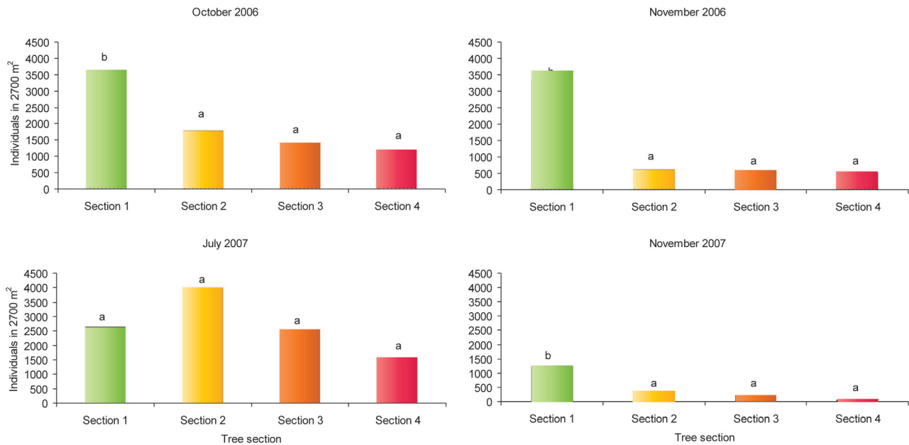
Figure 3. Total numbers of Llaveia axin axin females at different sections from the base of the main tree trunk ( Acacia colchiacantha ). Individuals were registered in 4 sampling dates. Different letters above bars represent significant differences ( t \geq 2 , p < 0.05 ) among tree sections: 1, up to 50 cm height; 2, 50 - 100 cm height; 3, 100 - 150 cm height, and 4, 150 -200 cm height.

(September 2009) and therefore it was not possible to register the mating behavior of the “aje”. Long-term observations are urgently needed on “aje” population dynamics.