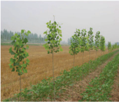
Fig.2 The first-stage project

Through the implementation of first-stage project, some preliminary results has achieved in the subsiding area, the function of ecological garden has been basically implemented. It forms a kind of ecological economy which is the joint operation of many kinds of industry, included agriculture, forestry, animal husbandry and sideline, fishery and so on. They process and promote each other, and make a development in an all-around way. The controlling effect in the first-stage project of the subsided area was shown in figure 2.