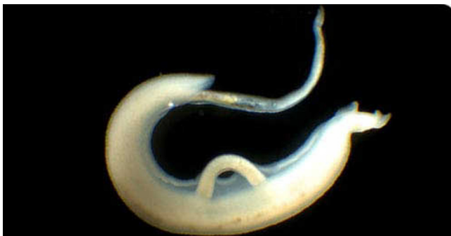
Figure 1. Schistosoma parasite.

Skin is the initial organ of contact where the parasite makes its first hideout and then transforms into another stage (schistosomula). Lungs and liver are the next area of migration, where it matures into the adult form. The adult worm then moves to specific body part depending on its species and sub-species. These areas include the bladder, rectum, intestines, liver, portal venous system (the veins that carry blood from the intestines to liver), spleen, and lungs. Schistosomiasis is not usually seen in countries like United States. It is often found in many tropical and subtropical areas worldwide [2] . Figure 1 illustrates the developed adult parasite and its body parts.