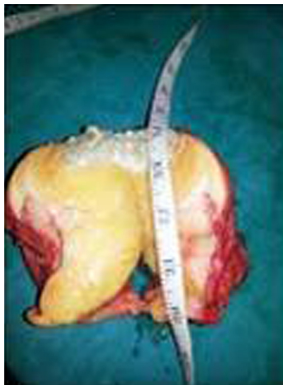
Figure 2 Gross specimen showing calcification.

Teratomas arise from uncontrolled proliferation of pluripotent gonadal germ cells and embryonal cells. Teratomas from germ cells