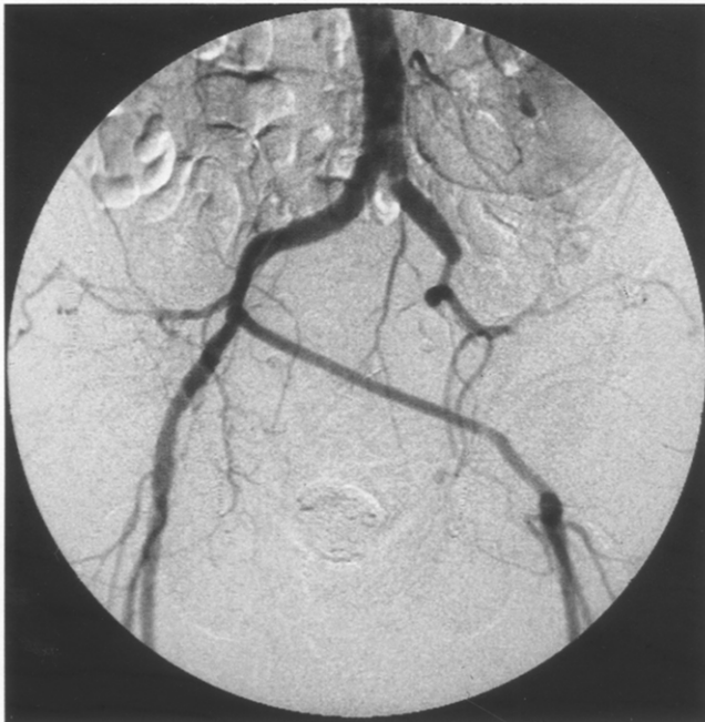
Fig. 2. Angiogram showing the completed right ilio to left femoral cross-over graft with 6 mm PTFE.

though not totally by the retroperitoneal method with similar operating times to this report. 2 There are also reports of laparoscopic aortobifemoral bypass successfully performed, though principally in the animal model. 3,4 This initial experience demonstrates that laparoscopic suturing of prosthetic graft to native artery can be safely performed. There was certainly the impression of a benefit in this patient, as he was ambulant the day following surgery and was discharged on the fourth postoperative day. With further experience and improved instrumentation, including vascular clamps, operating times will shorten. However, it remains to be seen whether this technique offers any significant advantage over the traditional open technique.