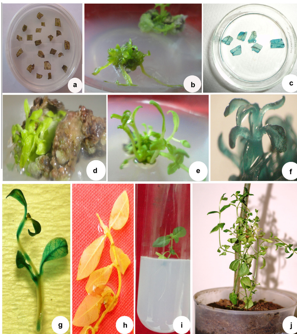
Figure 1 A. tumefaciens mediated genetic transformation and production of transgenic (hygromycin resistant) Woodfordia fruticosa (L.) Kurz. Using leaf segments as explants. (a) No shoot bud induction from the control leaf segments on selection medium supplemented with Thidiazuron (TDZ 4.54 \mu\text{M} ) and Indole-3-acetic acid IAA (1.14 \mu\text{M} ) + 25 mg/l hygromycin (PTSM 1 ). (b) Induction of multiple shoots from the control leaf segments on MSPGM (MS medium with 4.54 \mu\text{M} TDZ + 1.14 \mu\text{M} IAA). (c) Co-cultivated leaf segments showing Transient GUS expression after 3d of co-cultivation. (d) Regeneration of shoots from the cutting ends of leaf segments cultured on the PTSM 1 medium. (e) Elongation of shoots on PTSM 2 medium. (f) Hygromycin resistant shoot buds expressing blue coloration due to GUS gene expression observed under a stereo microscope. (g) Hygromycin resistant elongated shoot showing blue coloration. (h) No blue color was observed in control/wild type (WT) plant shoots. (i) Well-rooted transgenic plantlet on PTRM medium. (j) Transformants (Hygromycin resistant plantlets) in the plastic pots after greenhouse acclimation.

gentle shaking, and blotted dry with sterilized filter paper to remove excess bacterial suspension. Then they were co-cultivated on MS medium fortified with TDZ (4.54 \mu\text{M} ) and IAA (1.14 \mu\text{M} ) (CCM-Co-Cultivation medium) for 1, 2, 3 or 4 d under dark conditions at 25 \pm 2 °C. The co-cultivation medium was also fortified with 0, 50, 100 and 150 \mu\text{M} AS, to determine the optimum concentration of AS for transformation.