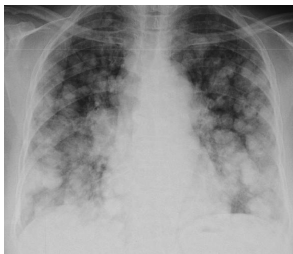
Figure 1. 67-year-old woman with endometrial cancer. Chest radiograph shows innumerable pulmonary nodules with “cannonball” morphology.

literature with special emphasis on radiological imaging.