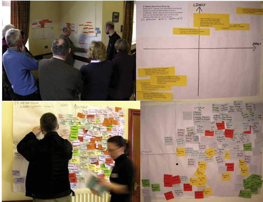
Fig. 2. Likelihood/impact matrix showing examples of the categorisation of scenario components by Nidderdale stakeholders (top left) and Peak District stakeholders (top right); and likelihood/impact matrix showing the categorisation of full scenarios by Nidderdale (bottom left) and Peak District stakeholders (bottom right).

since these were caused by different drivers, with similar effects. Neither of these scenarios were short-listed in the Peak District.