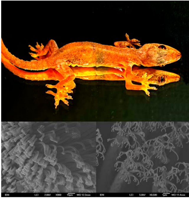
FIGURE 1 Images of spiny-tailed house gecko and its seta. (Top) A close-up photograph of the gecko on a glass-covered mirror used in this study. At the bottom are scanning electron microscope images of gecko setae showing the tree-like structure with a magnification of 900 times (left) and 8500 times (right).

surface simultaneously. In such a case, the measured adhesion force would be significantly stronger. More than 50 measurements were carried out in each experiment and the measured adhesion forces are plotted in a histogram (see Fig. 2, insets) to find the most probable value, distinguishing multispatula adhesion results from the more frequent single spatula event. The measured adhesion force for a single spatula can be deduced by this analysis although there are hundreds of spatulas on each seta.