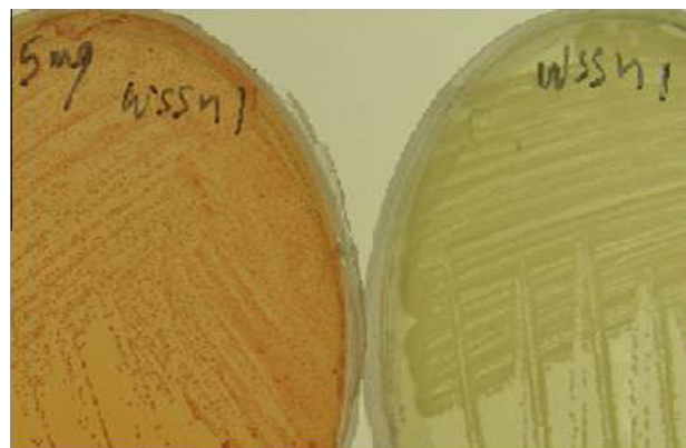
Figure 1 Pure GCSD colonies on TH-CR agar optimized medium supplemented with 30 \mu\text{g mL}^{-1} of Congo red and 5 \text{mg L}^{-1} oxolinic acid after 30 h of incubation at 37 °C compared to impure colonies on TH agar medium without oxolinic acid and Congo red dye supplements.

Determination of the soda , spegg , tuf and sagA genes sequence is surely one of the most efficient/accurate tools for identification of GCSD, but is still rather expensive to be used as a routine diagnostic screening method [10,11]. The term clone is used in isolates that are indistinguishable in genotype at which the most likely explanation is a common ancestor. In contrary to the popularity of DNA based identification/typing methods are only gradually implemented in molecular typing of the pathogen. Ideally, every typing method should be validated using multiple strains from different geographical regions and disease episodes. Pulsed-field gel electrophoresis [PFGE] targets the whole genome of the bacterium and is widely used as typing method for investigating genetic relationships between isolates. The whole bacterial DNA is digested by a specific restriction enzyme [usually SmaI and Apal for GCSD] to obtain a relatively small amount of fragments,