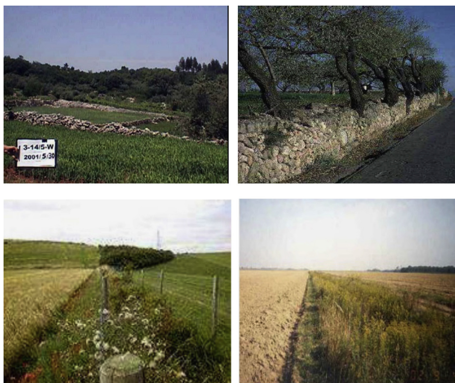
Fig. 1 – Examples of dry stone walls (photos above) and grass margins (photos below) reported in LUCAS survey.

along a transect of 250 m recording the sequence of land-cover types and linear landscape features. Among the total number of observations, 226,653 records (83.9%) are considered valid for this study because the rest were not completed by a surveyor (Van Der Zanden et al., 2013). Invalid points were well distributed all over Europe. The data is geo-referenced and is available in the LUCAS database (LUCAS, 2012). Among the landscape features recorded by a surveyor (LUCAS, 2013), we focused in this study on stone walls and grass margins (Fig. 1).