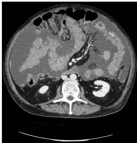
Fig. 3. Peritoneal carcinosis with massive ascites.