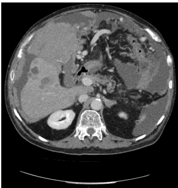
Fig. 2. A large mass involving the gallbladder and the anterior surface of the liver.

examination of the enucleated left eye showed a mixed-cell-type choroidal melanoma without intrascleral or vascular involvement. The size of the melanoma was 10 mm in thickness and 13 mm in diameter. Since then, the patient had been followed up regularly by an ophthalmologist. The last follow-up at 15 years after eye enucleation was negative for recurrence or metastatic diffusion. At the admission, laboratory tests were normal, except for increase CA-125 marker. Abdominal ultrasonography (US) and total body computed tomography (CT) scan were performed and revealed diffuse liver metastases in both lobes with a tendency to confluence, a large mass involving the gallbladder, associated with peritoneal carcinosis, bilateral adrenal metastases and a large mass in the left kidney (5 cm of diameter) compatible with another secondary localization (Figs. 1–3). EGDS and colonoscopy were performed in order to exclude other primitive malignant cancers. An ultrasound guided fine needle agobiopsy (FNA) of liver lesions was performed