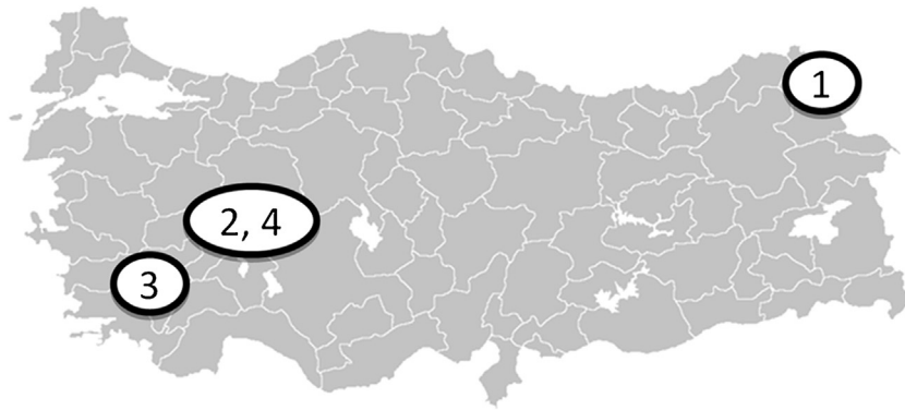
Fig. 1. Map showing locations of foot-and-mouth disease outbreaks investigated. 1) Ardahan province, Turkey September 2011 ( n = 296 ); 2) Afyon province, Turkey January 2012 ( n = 218 ); 3) Denizli province, Turkey June 2012 ( n = 405 ) and 4) Afyon province, Turkey July 2012 ( n = 311 ). Investigation 1) looked at the FMD Asia-1 Shamir vaccine. Investigations 2–4) investigated the new FMD Asia-1 TUR 11 vaccine (Sindh-08 strain).

light of this and the rapid spread of the Asia-1 virus across most of Turkey, the Şap institute, the Turkish FMD research institute and vaccine producer, changed their Asia-1 vaccine strain from Shamir to an isolate of the circulating Sindh-08 field virus (the vaccine is referred to as the TUR 11 vaccine). In this study, we investigated FMD Asia-1 vaccine effectiveness for both the TUR 11 and Shamir vaccine through retrospective outbreak investigations.