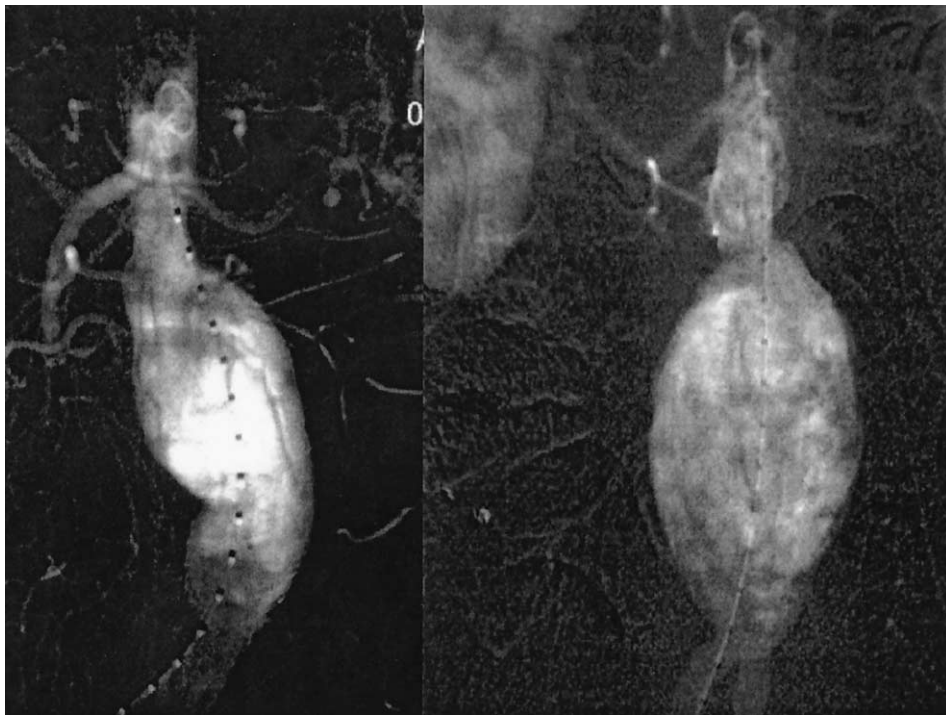
Fig 2. Anteroposterior angiographic images of an abdominal aortic aneurysm used in phase I ( left ) and phase III ( right ).

on the display. This was repeated until a map of the entire display was obtained (Fig 1).