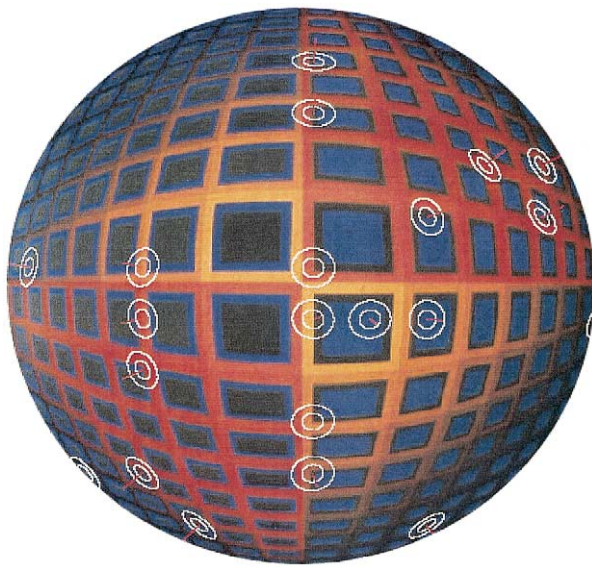
Fig 1. Example settings of the gauge figure at multiple points on a geometric image.

pital stay, and time off from work. 1 Despite these benefits, significant challenges have been noted. 1,3-6 The equipment and technology required for minimal access surgery is expensive; the assessment of safety, efficacy, and effectiveness of minimal access surgery procedures compared with conventional procedures is in its infancy; and, most important, educational issues have proved to be a significant hurdle to the widespread dispersion of minimal access surgery techniques.