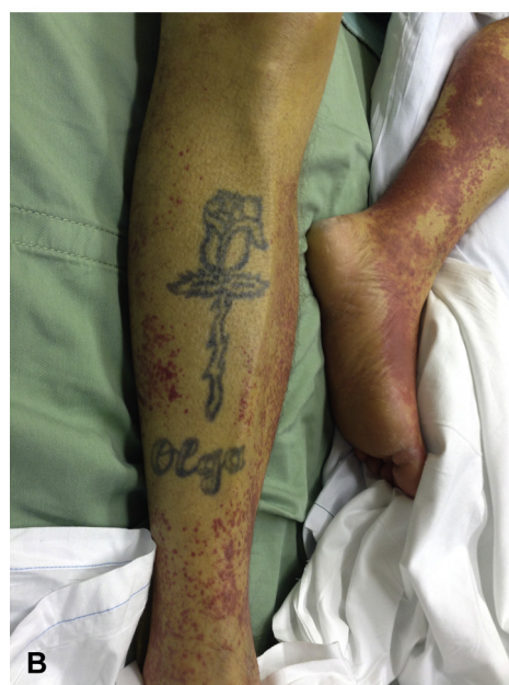
Fig 2. Palpable purpura exhibiting a “sparing phenomenon” with a 2- to 3-cm halo around a tattoo on the (A) right anterior thigh and (B) right anterior leg.

demarcated by the tattoo. The authors proposed several etiologic explanations for the sparing phenomenon over tattooed skin. These included the use of Hamamelis virginiana , a component of tattoo ink with known anti-tumor necrosis factor and anti-reactive oxygen species properties that may have had an inhibitory effect on the development of vasculitis, the potential of the tattoo dye to act as a photoprotective factor against light penetration into the dermis, and microvascular changes caused by tattooing.