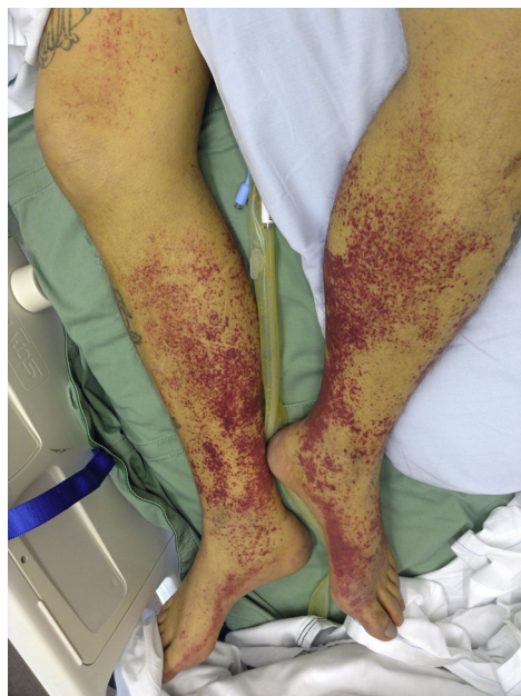
Fig 1. Extensive nonretiform palpable purpura on bilateral lower extremities.

Here we report, to our knowledge, an unusual case of LCV with sparing of tattooed skin to produce a “halo.” The phenomenon of one skin disease sparing the site of a previous skin condition has been recognized since 1981, when Cochran and Wilkin 3 reported a case of a drug rash failing to appear in a previously irradiated site on a 12-year-old girl. Since then, various related terms have been used to describe this phenomenon, including the reverse Koebner phenomenon (nonappearance or disappearance of skin lesions at sites of trauma) 4 and Wolf’s isotopic nonresponse (absence of a cutaneous eruption at the site of another unrelated and already healed skin disease). 5 Although the exact mechanisms and pathophysiology behind these sparing phenomena are unknown, current hypotheses suggest that alterations in the local structure or immunologic microenvironment at these sites may play a role. 6