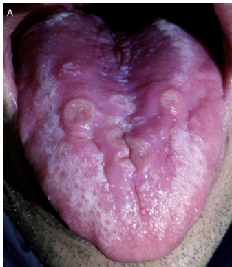
Fig. 1 – Asymptomatic ulcerated lesions in the tongue.

A 35-year-old man presented with a 3-week history of asymptomatic ulcerated lesions in the tongue (Fig. 1). He developed erythematous papules in the trunk and legs at the same time. The patient had no other systemic symptoms and reported having had unprotected sexual intercourse. Testing for the human immunodeficiency virus was positive. VDRL testing was positive with a titer of at least 1:64. A tongue biopsy revealed an inflammatory infiltrate suggestive of secondary syphilis with positive immunohistochemistry for Treponema pallidum (Fig. 2). The patient was treated with intramuscular benzathine penicillin for two weeks. The lesions completely resolved during a 4-week period. Syphilis is well known for