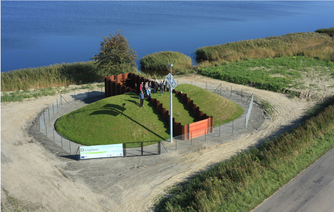
Fig. 1. The view of the experimental dike in Poland

The Fig. 1. presents the general view of the experimental dike near Gdansk – after completion. The dike body forms the composite material consisting of 70% ash and 30% sand. The mixture was carefully chosen after the series of the laboratory tests, in procedure as described above. The total dimensions of the dike are: height 3 m, width 15 m, length: 24 m, with slopes inclined by ratio 1:2. The cross-section of the construction is presented in the Fig. 2.