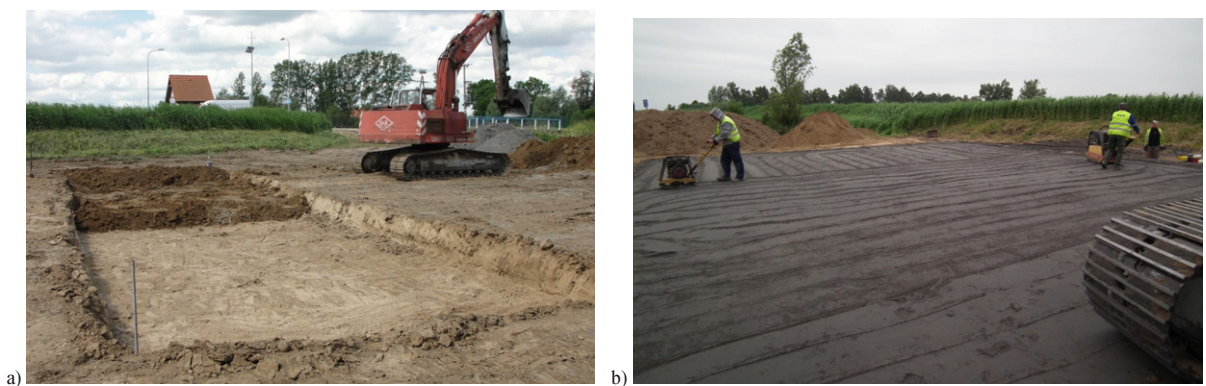
Fig. 4. Construction stages: (a) preparation – removal of soft soil (b) compaction of single layer of dike body

The construction stages should be carefully planned and verified. After preparation phase – removal of unnecessary organic and soft layers of soil (Fig. 4a), one of important aspects is compaction control of the dike body during construction. In Fig. 4b one can see early stage of the dike construction and a classical technology of compaction – in case of small structures. It is clear that in case of larger structures one will use proper, heavy equipment [10]. Each layer of the construction needs to be controlled and the compaction verified (see Fig. 5a). In this case one can see clearly advantages of used composite – even heavy machines make no visible deformation of the dike body (see Fig. 5a). The last step is to create the bio-surface of the dike, the greening can be achieved by hydroseeding or other techniques; the final view of experimental dike is presented in the Fig. 1.