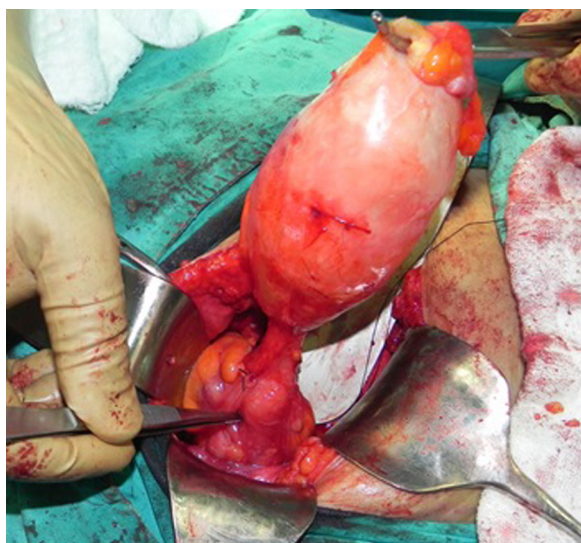
Fig. 2. Mucinous neoplasm growing out of the appendix (intraoperatively).

passage of mucus in the surrounding fat, in an area with occasional calcifications and otherwise minor leakage (Fig. 3b). This area was surrounded by soft tissue reaction. The postoperative period was uneventful. The patient has been followed for one year and there are no clinical or biochemical findings suggesting a recurrence.