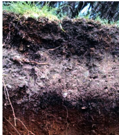
Fig. 5. Podzol in the Bucegi Mountains.