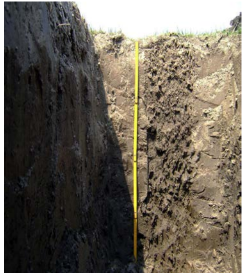
Fig. 3. Argic phaeozem in the Burnas Plain.

Cambisols, spodosols and umbrisols represents another quarter of the country (25.5%), but the share is held by cambisols a rate of over 19%.