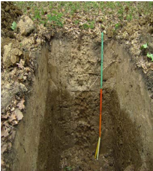
Fig. 4. Albic luvisol in the Candesti Piedmont.

Making a comparison between natural of soils zones and the climate and vegetation, we find that they do not coincide, nor should coincide, because the soil formation also attended other factors besides climate and vegetation.