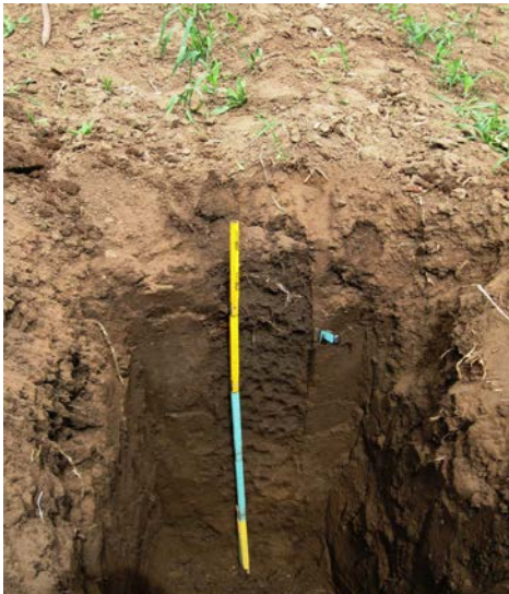
Fig. 2. Cambic chernozem in the Moldavian Plain.