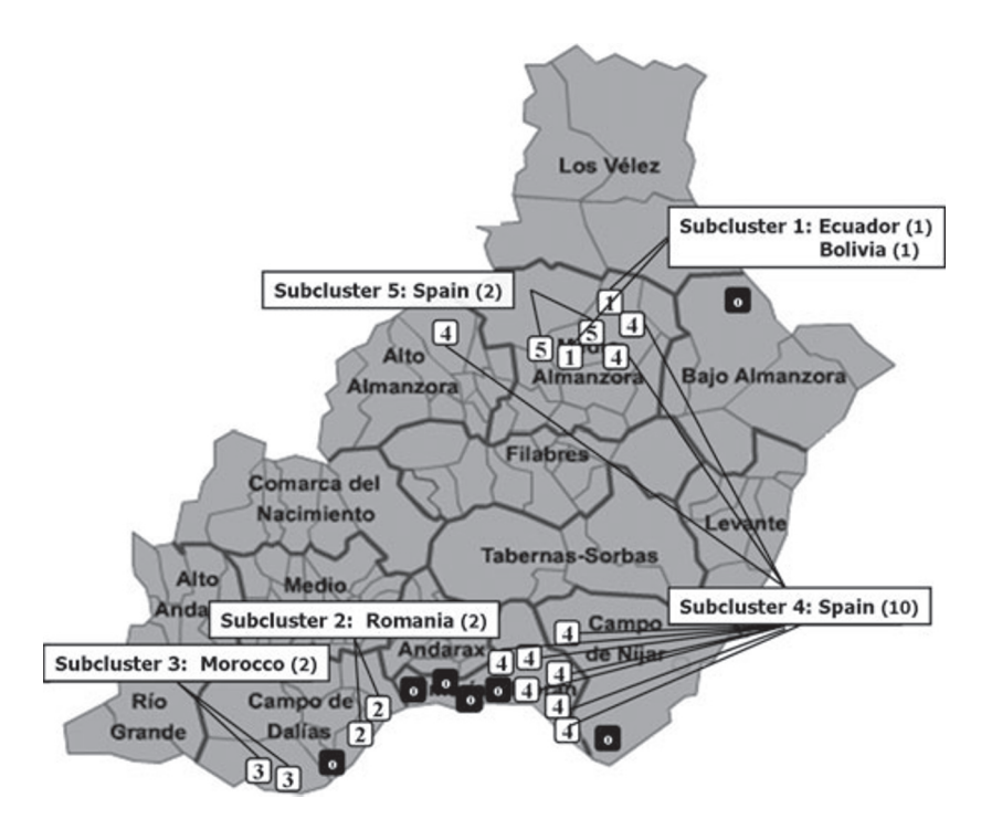
FIG. 4. Geographic distribution of the cases infected by M6 isolates in Almería. The subclusters identified by mycobacterial interspersed repetitive units (MIRU) within the restriction fragment length polymorphism-defined M6 cluster are shown as numbers. White squares represent the cases clustered by MIRU. Black squares represent cases shown as orphan (o) by MIRU.

although three cases were geographically unrelated, most of the cases (7/10) were also geographically close (Fig. 4).