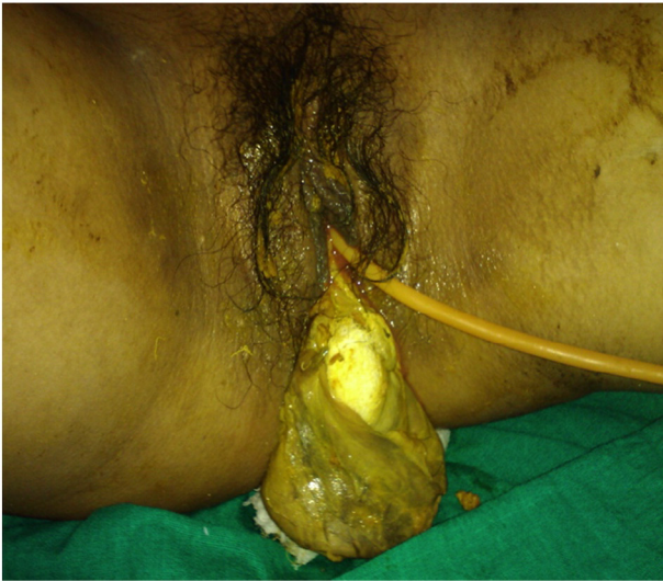
Fig. 1. Large gut about 10 cm with multiple perforations with impacted partially formed stools