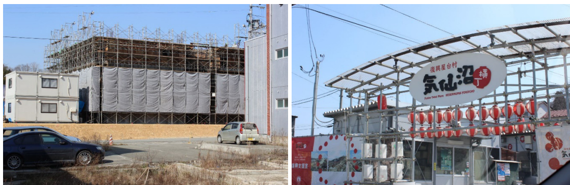
Figure 4 (upper left). The ground level rising work under construction in Sakanamachi, Kesennuma