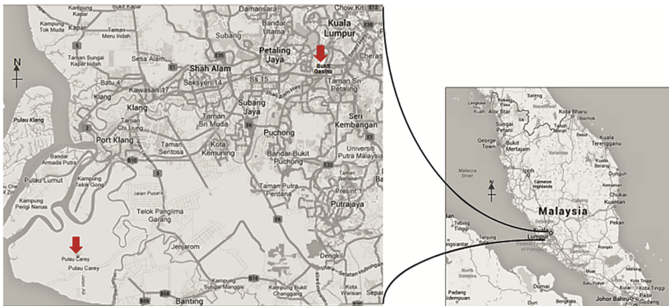
Figure 1. Map of the study areas Bukit Gasing and Pulau Carey in Selangor state, Malaysia.

Two independent individuals, using an Olympus CX40 light microscope (Olympus, Japan), examined the stained blood films for microfilaria. The microfilariae were observed at 100× and 400× magnification, and images of the microfilaria detected were captured using an on-board Olympus DP12 digital microscope camera (Olympus, Japan). Data entry and analysis were performed using Microsoft Excel 2010.