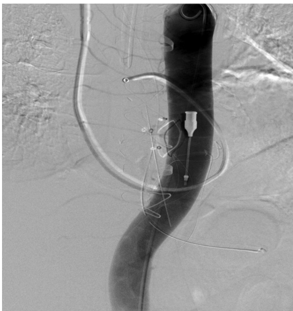
Fig. 2. Cannula noted in the distal thoracic aorta.

Due to the fixed position of the cannula, we felt it was imperative to rule out an unidentified aortic abnormality at this location. Our initial arterial access was upsized from a 5-French sheath to a 9-French sheath. An 8-French intravascular ultrasound (IVUS) catheter (Volcano Corporation, San Diego, CA) was then used to evaluate the descending thoracic aorta. No aortic abnormality was identified that may have prevented the caudal migration of the cannula. We surmised, then, that the cannula was lodged obliquely between the anterior and posterior aortic walls.