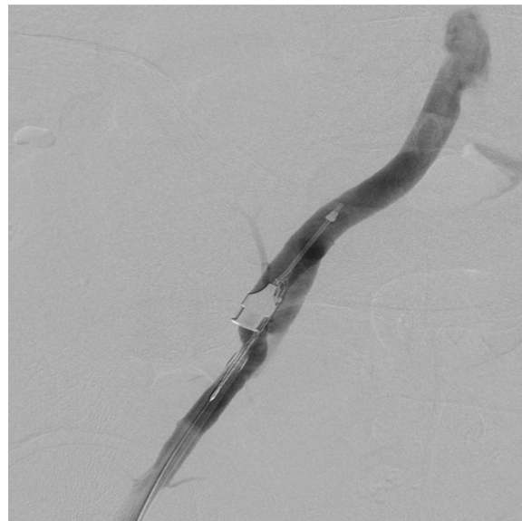
Fig. 3. Cannula noted in right external iliac artery.

A tri-lobed snare, EN Snare® (Merit Medical Systems, South Jordan, UT) was used to grasp the cannula at its tip and withdraw it into the distal aorta. At the aortic bifurcation, the cannula rotated 180 degrees. This rotation led to the cannula becoming temporarily lodged on the aortic bifurcation. In order to dislodge the cannula and allow retraction into the right iliac system, we advanced and rotated the snare. These maneuvers allowed further rotation of the cannula and successful withdrawal into the right iliac system. Due to its large size, the irrigating cannula could not be retrieved further than the distal external iliac artery (Fig. 3). The olive tip measures 45 mm in length and 5.5 mm in width. The cannula was successfully