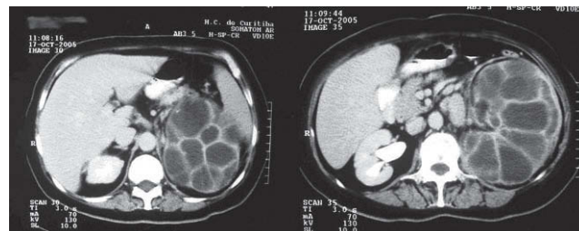
Figure 3: CT scan of xanthogranulomatous pyelonephritis. There is diffuse enlargement of the left kidney and the renal tissue is replaced by multiple low-attenuated masses. The contralateral kidney is normal.

platelets 559,000/mm 3 , creatinine 1.4 mg/dL and urea 46 mg/dL. Urinalysis showed pH 6, proteinuria 2+, leukocyturia 4+, hematuria 4+ and bacteriuria. Urine culture was positive for Escherichia coli . For this reason levofloxacin was initiated. Abdominal ultrasound showed a staghorn stone in the left kidney, with signs of xanthogranulomatous pyelonephritis. CT scan shows the characteristic replacement of the renal tissue by several rounded, low density areas that are surrounded by an enhanced rim of contrast medium. These images correspond to dilated calyces lined with necrotic xanthomatous tissue extending into the renal parenchyma (Figure 3). She was submitted to a left nephrostomy, with drainage of 2 L of purulent secretion. After antibiotic therapy, the patient improved steadily.