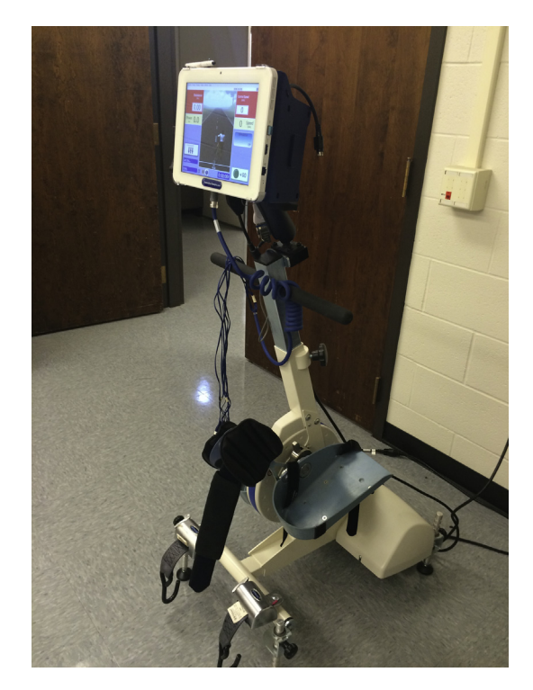
Fig. 2. Photograph of the RT300 functional electrical stimulation cycles (Restorative Therapies Inc, Baltimore, MD).

Data analysis will be performed using IBM SPSS Statistics 22.0 (IBM Corp., Armonk, IL). We will initially examine the data for outliers and non-normality. The effect of the intervention will be examined using Condition \times Time mixed model ANOVA. Condition will be a between-subject factor and time will be a within-subject