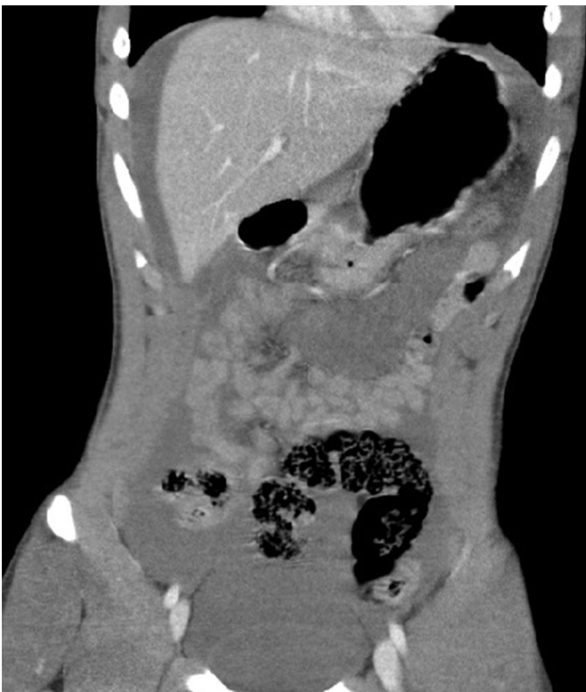
Fig. 2. Coronal CT image of mass abutting the stomach.

This 17-year old boy had an unusual presentation of an uncommon tumor: a torted, ischemic GIST causing hemoperitoneum. GISTs, which are often exophytic, can be pedunculated and may thus be at risk of torsion. Tumor rupture has been described as a source of hemoperitoneum, and tumor necrosis from the ischemia of torsion may result in significant bleeding into the peritoneal cavity [4–14]. Pediatric GISTs are typically characterized by a wild-type mutation rather than the classical c-kit or PDGFR mutations seen in adult GISTs. This patient's tumor was more of the adult-type (c-kit positive and mutation detected in PDGFR exon 18), and thus he was referred to the adult oncology service. His treatment has followed the adult GIST guidelines of resection and tyrosine kinase inhibitor therapy.