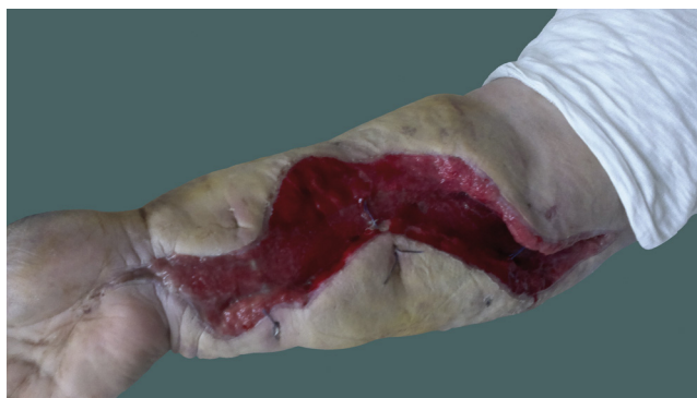
Fig. 3. Postoperative view of the upper right extremity (15 days after surgery).