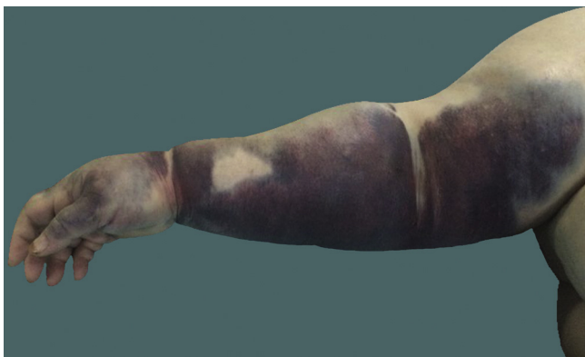
Fig. 1. Preoperative view of the upper right extremity.

(BMI >40 kg/m 2 ) and conscious female patient diagnosed with massive pulmonary embolism and receiving tPA, are presented in the light of the data in literature.