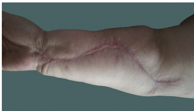
Fig. 4. Postoperative view of the upper right extremity (3 months after surgery).

with approximation sutures. The dressings were changed using rifamycin sodium ampoule and nitrofurazone 0.2% pomade. The patient, whose pain, numbness, swelling and tautness rapidly subsided after the operation, was followed up through daily dressing changes. As infection symptoms such as purulent discharge, fever and bradycardia were observed in the fasciotomy area during the follow-up, the patient underwent repeated debridements and was started on antibiotic treatment. When the patient's infection was brought under control and her general condition became stable, the fasciotomy area was closed on the 15th day without using any grafts (Fig. 3). During the follow-up visit in the 3rd postoperative month, the hand, wrist and elbow ranges of motion were full, and the neurological and motor power examinations were normal (Fig. 4). The patient gave informed consent for the data concerning her case to be submitted for publication.