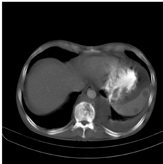
Fig. 5 – Vertebral lytic destructive lesions.

including central nervous system, bone marrow, lymph node, eye, gastrointestinal tract and thyroid. 4 It is mentioned that as a consequence of inadequate concentration of aerosolized pentamidine to suppress systemic infection, it is a contributing factor for extra-pulmonary Pneumocystis infection and as a prophylaxis is insufficient to suppress dissemination. 5,6 Low CD4 count, history of other infections, PCP and aerosolized pentamidine prophylaxis are risk factors of extra-pulmonary infection in HIV-infected patients. Extra-pulmonary infection can occur as a complication of PCP. 7,8