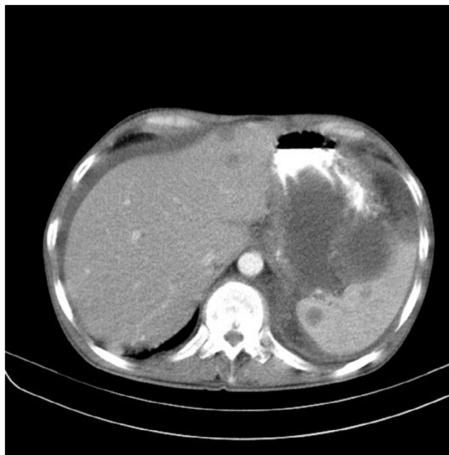
Fig. 1 – Multiple cystic lesions in liver.

like fever, cough, and dyspnea. CXR appearances are mostly seen as bilateral diffuse symmetric finely granular/reticular interstitial/airspace infiltration and most common CT features are patchy work pattern (56%), bilateral asymmetric patchy mosaic appearance. 2,3 However, negative CT does not rule out the diagnosis. While PCP is the most prevalent severe pulmonary infection in HIV-infected patients, extra-pulmonary pneumocystosis is almost rare. Extra-pulmonary Pneumocystis infection occurs in HIV-infected patients on pentamidine prophylaxis or in advanced HIV infection without prophylaxis, even without pulmonary involvement. It can affect all organs