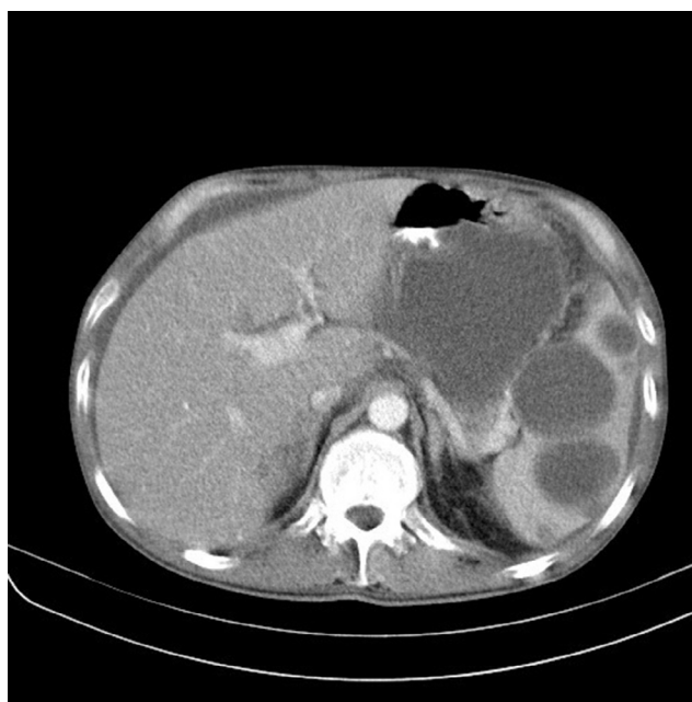
Fig. 2 – Multiple cystic lesions in spleen.

like fever, cough, and dyspnea. CXR appearances are mostly seen as bilateral diffuse symmetric finely granular/reticular interstitial/airspace infiltration and most common CT features are patchy work pattern (56%), bilateral asymmetric patchy mosaic appearance. 2,3 However, negative CT does not rule out the diagnosis. While PCP is the most prevalent severe pulmonary infection in HIV-infected patients, extra-pulmonary pneumocystosis is almost rare. Extra-pulmonary Pneumocystis infection occurs in HIV-infected patients on pentamidine prophylaxis or in advanced HIV infection without prophylaxis, even without pulmonary involvement. It can affect all organs