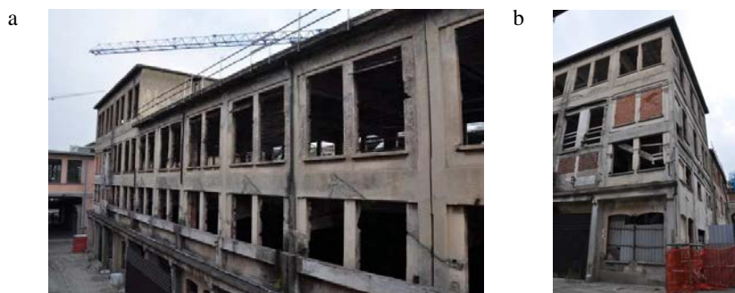
Fig. 1. The ex-industrial building.

The building, characterized by a total floor area of about 2500 square meters, has a rectangular plan and its main axis is North-South oriented. Nowadays, it comprises external opaque façades distinguished for historic value, roof and intermediate slabs without any interior partitions. Due to the fact that the ground floor is characterized by about 8.7 meter height, building refurbishment includes the addition of an intermediate slab. Consequently new total floor area amounts to 3600 square meters.