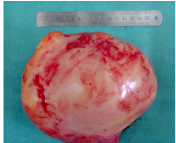
Figure 2 Gross appearance of the excised mass after removal from the chest.

On the basis of the patient's symptoms and the likelihood of resectability, we proceeded with a right thoractomy with single lung ventilation. A huge intrapleural mass measuring 18 cm × 12 cm × 10 cm and weighing 640 g was found attached to the inner surface of the chest wall by a 1 cm stalk. No other masses were found elsewhere. The mass was