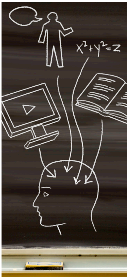
Figure 1. Blended Learning Combines Different Means of Content Delivery

an undergraduate biochemistry course at Columbia University, were invited to participate in a randomized controlled trial in the fall of 2014. A total of 111 students enrolled in the study. We used a two-by-two study design, in which we compared the effects of both video versus textbook pre-class assignments and lecturing with instructor-demonstrated problems versus lecturing with student problem-solving in class. Students were randomized to one of four arms: (1) textbook preparation for lecture, (2) video preparation for lecture, (3) textbook preparation for problem-solving class, or (4) video preparation for problem-solving class (Figure 2). The students were stratified for randomization by gender and prior exam performance (low: lower third versus high: upper two-thirds) into each of the four arms to ensure equal representation of these students in each study arm; 54% of students in the study (60/111) were male (Figure 2).