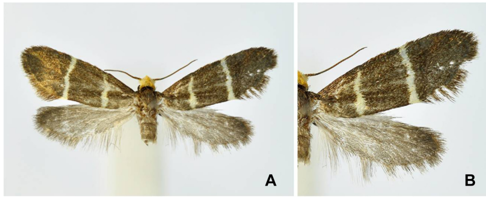
Figure 1. Lampronia flavimitrella (Hübner). A, adult; B, dorsal view of the wing pattern.