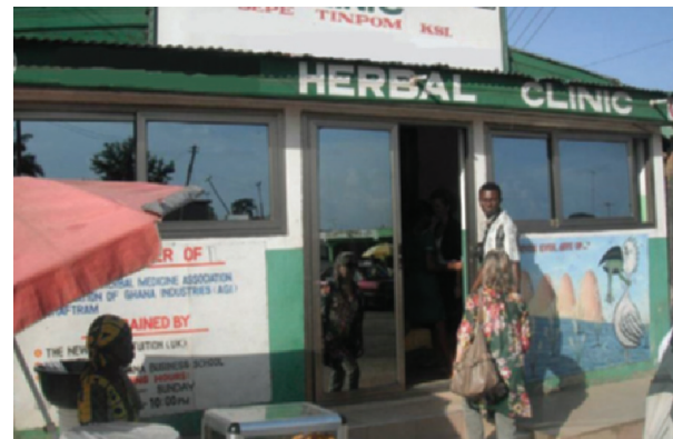
Figure 2 - A herbal clinic in Sepe Tinpom, Kumasi, Ghana.