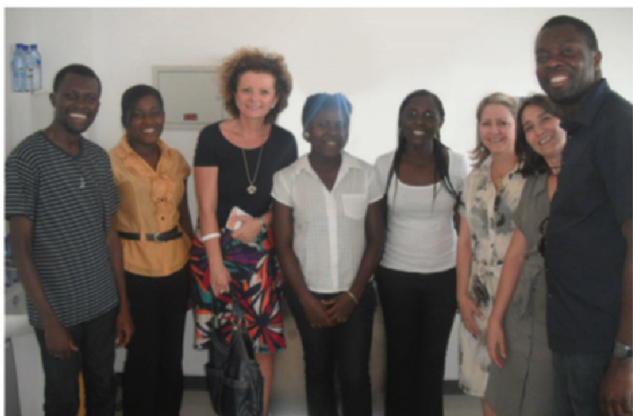
Figure 3 - Photo with the graduated herbalists. Lekma Hospital, Kpeshie, Accra, Ghana.

Among the communicable diseases, tuberculosis and AIDS are huge public health problems in Ghana. It is estimated that approximately 20,000 people contracted tuberculosis in that country in 2011, of which around 22% were not detected and notified (WHO-CIDA, 2012). According to 2011 data from the World Health Organization, 14,962 cases of tuberculosis were notified, comprising an incidence of 79 cases per 100,000. Of these, eighteen cases per 100,000 corresponded to co-infection with HIV-TB (WHO, 2011). The policy for dealing with TB/HIV co-infection in Ghana states that "No systematic, nationwide study has been conducted to assess the prevalence of TB/HIV co-infection in the country. However, it is estimated that the influence of HIV on TB has been increasing. Whereas in 1989 roughly 14% of Ghana's TB cases could be attributed to AIDS, by the year 2009 about