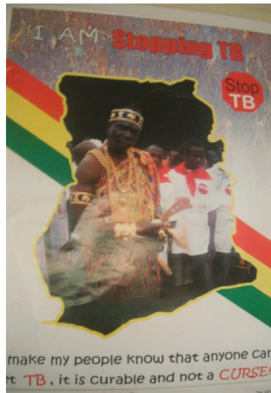
Figure 4 - Poster of a tribal chief motivating people to communicate TB (fixed in the Komfo Anokye teaching hospital, Kumasi, Ghana).

It can be seen, therefore, that there are efforts to organize a healthcare service for TB and other prevalent diseases that impact the health of the population, and that in general, the model adopted follows the international guidelines (Fig. 4). However, without economic, geographical, cultural and organizational conditions that are consistent with the models developed in and for other regions of the world, there is a delay, and significant limitations in health programs for dealing effectively with communicable diseases, which compromise their results. What is noticeable is the clear separation between the official healthcare system and the therapists (especially the traditional healers, but also to the new herbalists and therapists with some formal education), and the health programs are failing to capitalize, in a systematic way, on the influence, proximity and legitimacy of these professionals, especially those practicing in more remote regions, as support