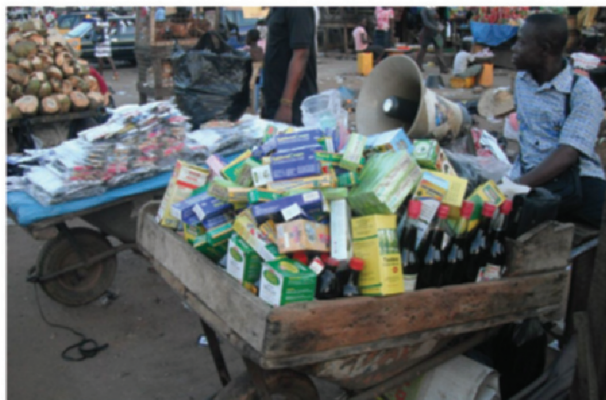
Figure 5 - Central Market, Kumasi, Ghana.