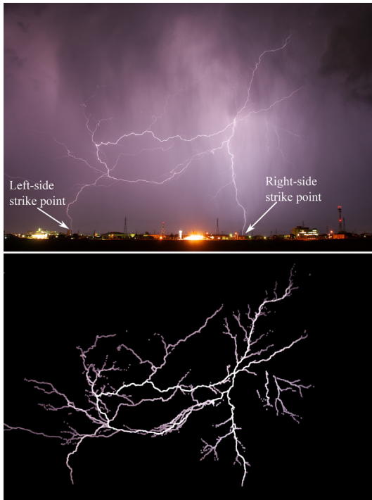
Fig. 1. (Upper) Original lightning image and (Lower) extracted lightning channel. The extracted lightning channel is thickened by applying thickening processing to improve visibility, since it is very thin.